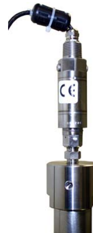
Figure 2: Top Mount Pressure Transducer