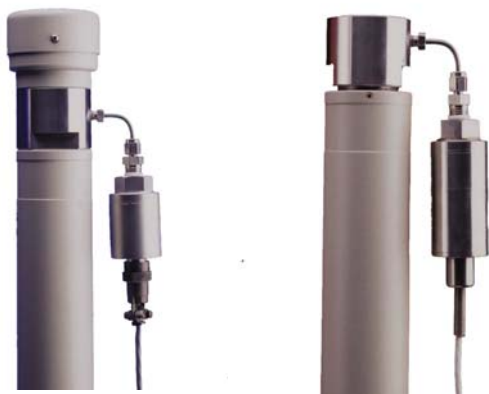
Figure 4: High Accuracy (left) & High Temperature (right)

The Side Mount transducer is internal and is the same as the Standard transducer, but the signal amplifier is mounted to the side of the cap instead of on top to lower the height of the unit.