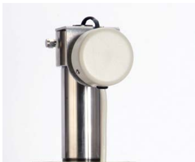
Figure 3: Side Mount Transducer