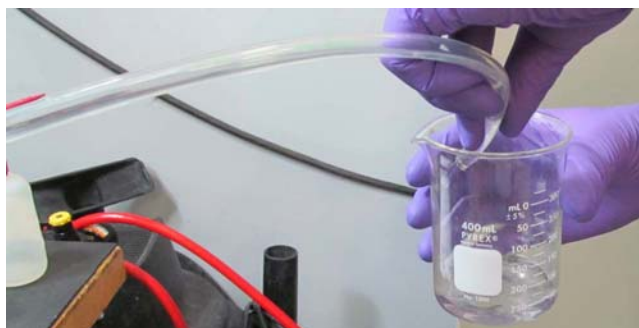
Figure 3: Draining the acetone into a 100 ml beaker