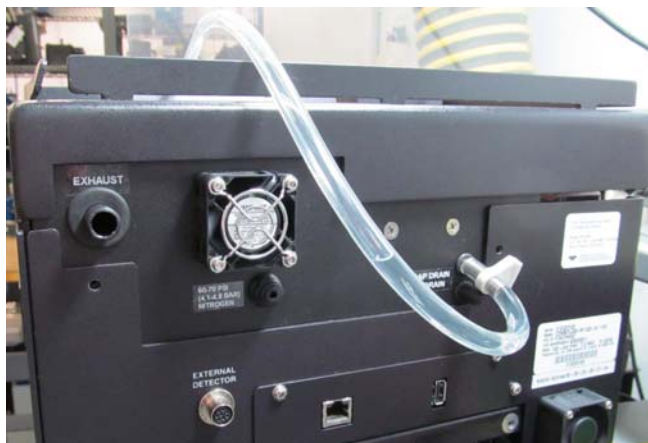
Figure 4: P-trap pump drain line draped over the unit