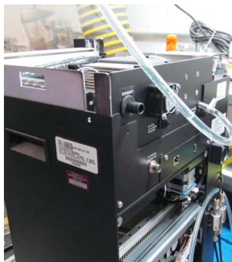
Figure 2: Line filled with 40 ml of acetone