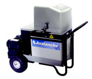
Avalanche portable refrigerated sampler