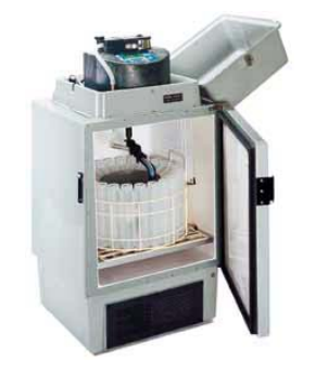
"Your Source for Samplers!"