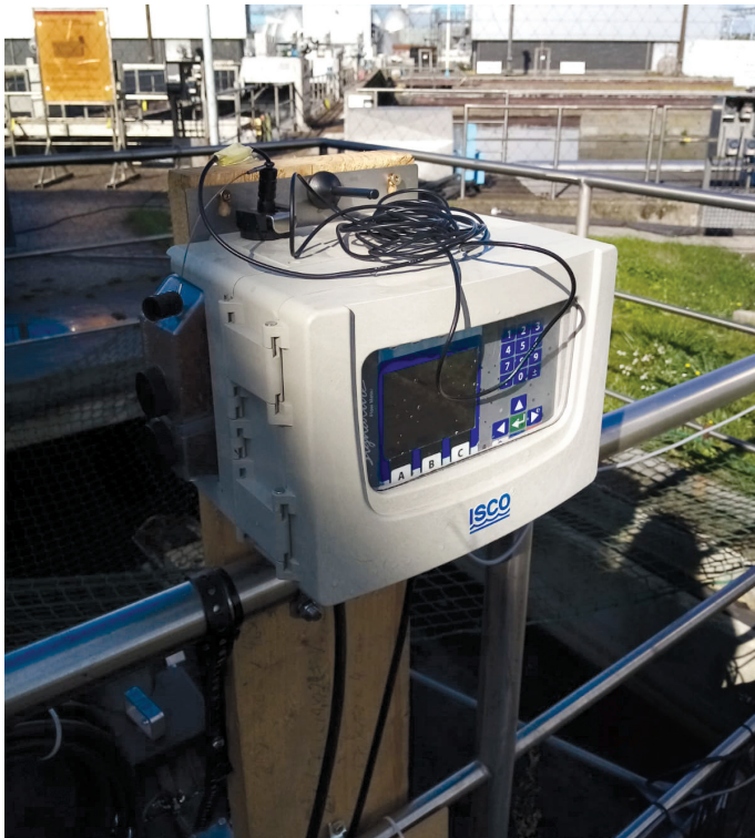
Signature logger installed at Köhlbrandhöft WWTP.

The flow data was collected locally in the Signature® logger and pushed remotely via GSM communication to Teledyne ISCO's Web User Interface Flowlink® Global.