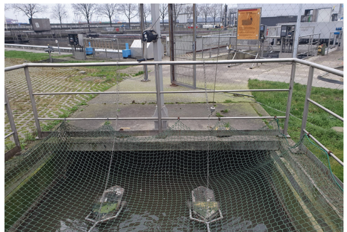
Existing contact sensors attached to floats at inlet channel of Köhlbrandhöft WWTP.

Köhlbrandhöft and Dradenau WWTPs combined have a total capacity of 1 mln m 3 /day, a population equivalent (PE) of 2.2 million. Both plants are managed by Hamburg Wasser Company, Northern Germany's largest public water-supply and wastewater utility. Measurement points are located on the 3-meter wide rectangular channels at the inlet of Köhlbrandhöft and the outlet of Dradenau. Tests performed in September and November 2020 were designed to compare against existing Doppler Area Velocity sensors attached to floats (Köhlbrandhöft), and on the channel bottom (Dradenau). Higher-than-expected failure rates caused the user to consider the possibility that non-contact laser technology would be less affected by wastewater composition and fluctuations in flow.