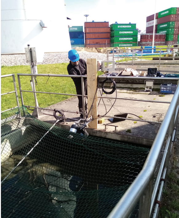
LaserFlow at inlet of Hamburg Köhlbrandhöft WWTP.