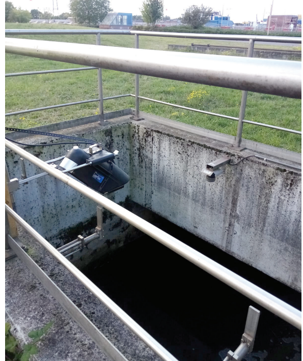
LaserFlow at outlet of Hamburg Dradenau WWTP.

Teledyne ISCO's LaserFlow® sensor was installed for a test measurement purposes at the inlet of Köhlbrandhöft WWTP and outlet of Dradenau WWTP, both located in Hamburg city. The two weeks tests for each site allowed to check sensor at various flow conditions and prove its accuracy and reliability.