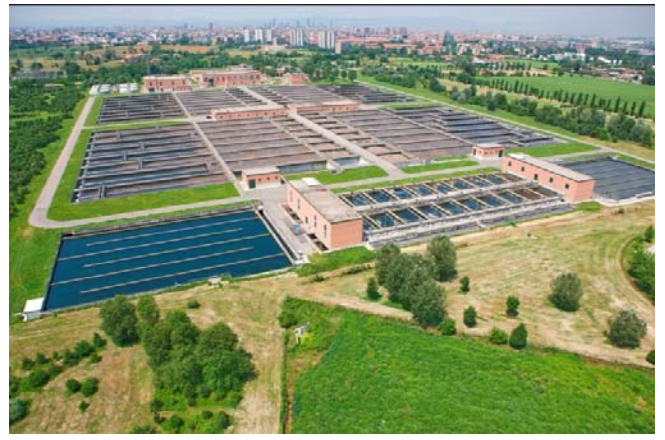
Nosedo Wastewater Treatment Plant, Milan

Four Signature<sup>®</sup> Flow Meters, each configured with 360 LaserFlow<sup>™</sup> sensors, were installed at the inlet of Nosedo Wastewater Treatment Plant (WWTP) in Milan, Italy. This flow monitoring technology provided a unique solution for the challenging flow conditions at this site. Non-contact Doppler laser technology was chosen by the user for their continuous and maintenance free flow monitoring.