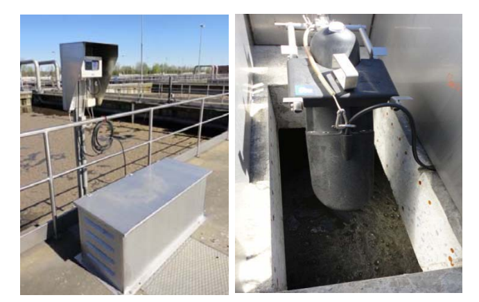
Figure 1: Signature flow meter with LaserFlow sensor sheltered in weather encloser

Flow monitoring in the wastewater treatment process is key for verifying performance of the plant as a whole, as well as its individual processing sections. Due to the enormity of the plant's processing capacity sewage streams are transferred to the plant through different main sewers, which merge into four rectangular inlet channels, each with a width of 1.5 m. At this location, the Signature flow meters and their non-contact LaserFlow sensors were installed over each of four inlet channels and sheltered in all-weather enclosures (Figure 1).