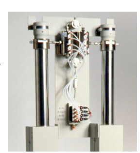
Table 4: Options & Accessories for HP Pump Models