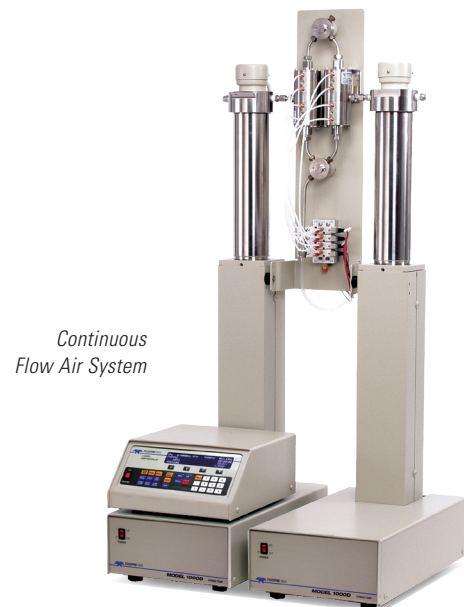
Continuous Flow Air System