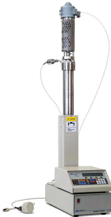
Typical D-Series pump configuration with mixer assembly.