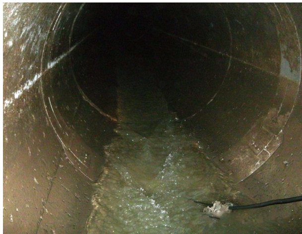
View of flow inside the pipe

This site, in a sanitary sewer, had two options for flow monitoring applications. The first application was in front of an overflow bypass gate where standard area velocity flow monitoring technologies were installed and working, but only intermittently. When the gate closed, the water surcharged the pipe until it overflowed into the bypass weir. The AV sensor was no longer able to read the bypass flow because the water at the bottom of the channel was no longer flowing. Another challenge was with the pipe joints creating turbulence.