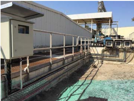
Signature installation with signal and power termination

The Al-Ansab Waste Water Treatment Plant has a capacity of 53,000 m 3 /day and is part of one of the largest engineering projects in the field of reusable treated wastewater for irrigation. It is located in the capital of Oman – Muscat, with a population of around 800,000 inhabitants. The Oman Wastewater Services Company, Haya Water, has been awarded the contract to develop, design, implement, operate, and maintain the wastewater facilities in Muscat Governorate.