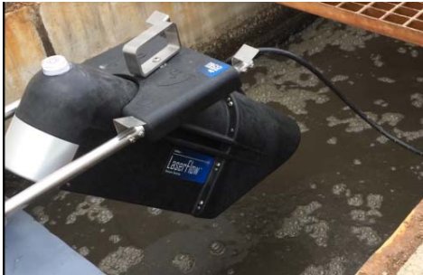
LaserFlow sensor installed in the middle of Channel 1

Additionally, the LaserFlow sensor can take velocity measurements at up to fifteen subsurface measurement points. Being able to measure at multiple points minimizes the effects of turbulence and eliminates the need for manual profiling. By producing a level measurement and an exceptionally accurate mean velocity reading, LaserFlow renders some of the most accurate area velocity results in the industry.