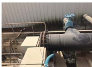
Submerged flume and additional capacity discharge into Channel 1

The wastewater is transported via tank trucks to the WWTP and pumped into Channel 1. Inlet channel flow is measured using flumes. During increased tank truck traffic, the flumes are frequently submerged making the flow unmeasurable. Additional capacity pipes have been routed around the flumes directly into Channel 1 to help alleviate this issue.