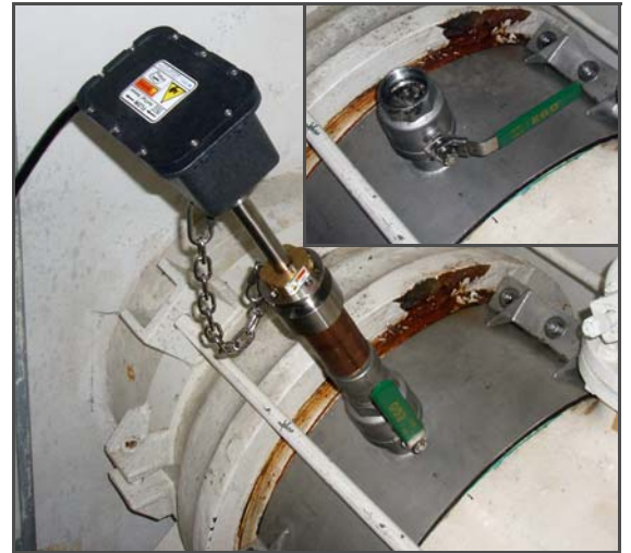
Figure 2: ADFM Hot Tap sensor installation

The four (4) velocity sensors at the end of the ADFM Hot Tap shaft emit short pulses (pings) along narrow acoustic beams pointing both upstream and downstream in the flow. Each sensor precisely measures velocity at multiple level points (bins). One measurement can consist of hundreds of pings, yielding thousands of velocity data points throughout the water column. The measurements are then used to determine the flow pattern over the entire flow cross-section, creating a true velocity profile. Since the flow pattern and measured velocity distribution are independent of each other, the ADFM Pro20’s advanced flow algorithms automatically adapt to changing hydraulic conditions. It removes the need for in-situ calibration and ensures accurate flow rate measurement even in difficult flow conditions including turbulence, entrained air, non-uniform flow, backwater, high velocity, near zero or zero velocity and reverse flow.