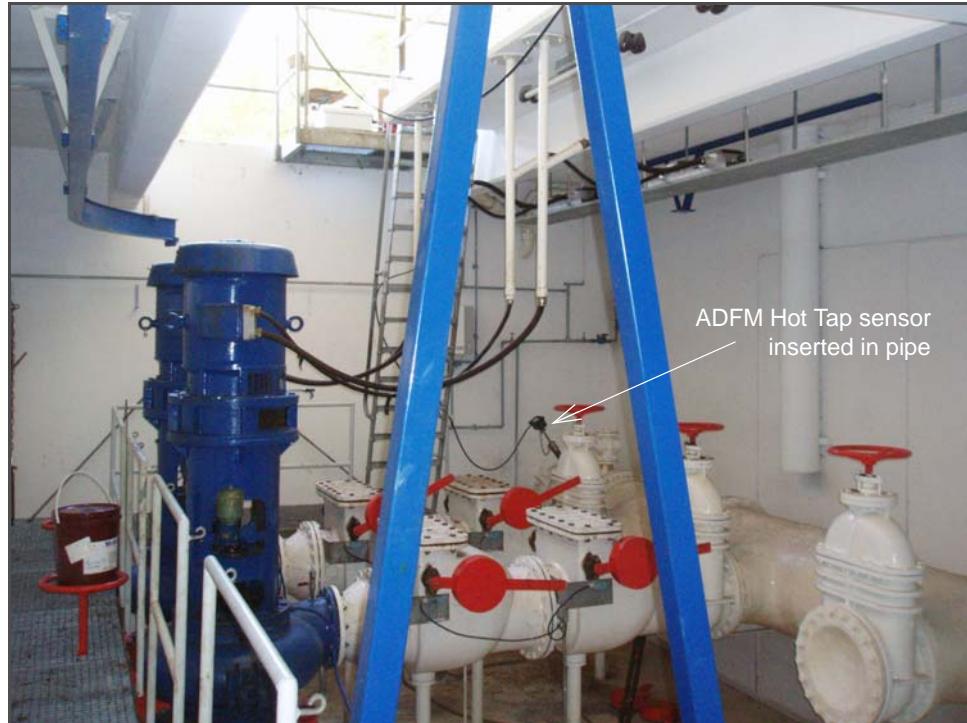
Figure 1: Middelfart pump station ADFM Hot Tap installation with 2 pipe diameter straight run

The ADFM Hot Tap Pulsed Doppler flow meter from Teledyne Isco, Inc. provides a high accuracy and cost saving flow monitoring solution at a pump station with limited straight run in Middelfart, Denmark.