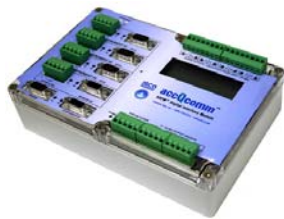
accQcomm Interface Module