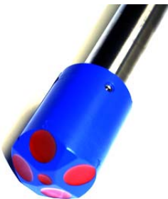
ADFM Hot Tap sensor