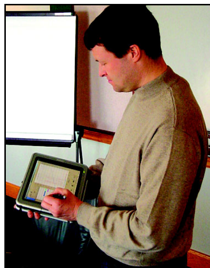
Figure 4: Monitor from anywhere Here, a chemist uses a wireless tablet PC to check the status of a separation running in a remote lab. Because CombiFlash Companion has its own built-in Linux-based web server, it is easy to implement wireless connectivity using standard, readily-available personal computer accessories. ⓘ

Chemists stay in touch with their instruments from wherever their other work takes them. Data from previous chromatographic separations are equally accessible from any internet connection, and delivered in convenient formats. However, when there is a need to return to the instrument, the space-saving PDA provides touch-screen control. Eliminating the traditional, dedicated PC once again allows the space in and around the fume hood to be used for chemistry, not computing. The overall savings in time spent on compound purification enables the medicinal chemist to advance more synthesis projects to completion.