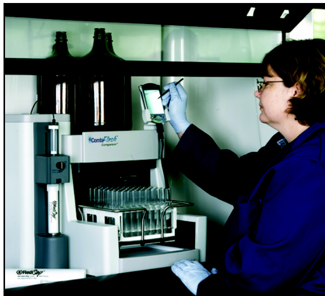
Figure 2: Isco's CombiFlash Companion fits conveniently in a hood. The system can hold a standard touchscreen PDA for on-board control via the PDA's browser software.

The same computer and communication technologies that allow universal Internet access can also give chemists the freedom to monitor and control an instrument from any location. The CombiFlash ® Companion ™ from Isco, Inc. (Figure 2) is the first chromatography system of any type to implement this type of next-generation networked interface.