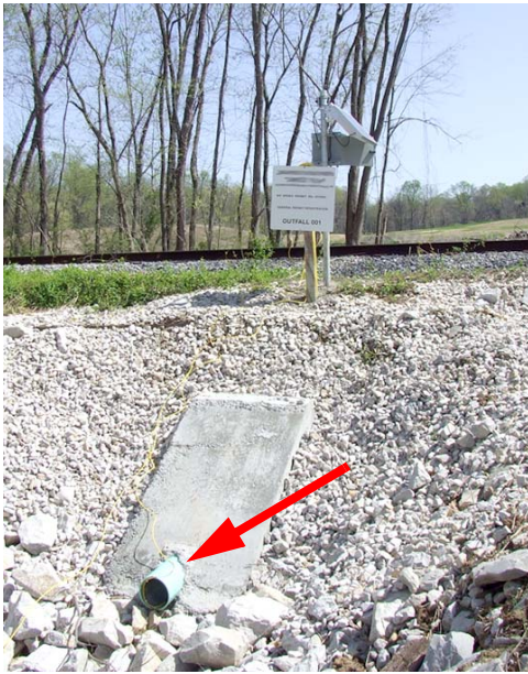
Measuring the temperature at the discharge pipe